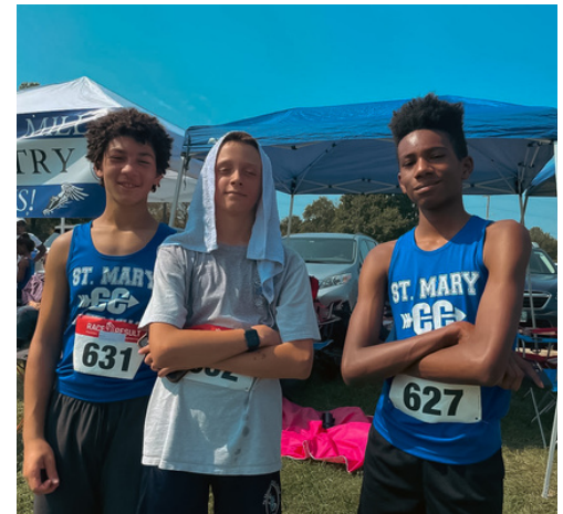
Pictured above are pictures of our Stallions Cross Country Team.