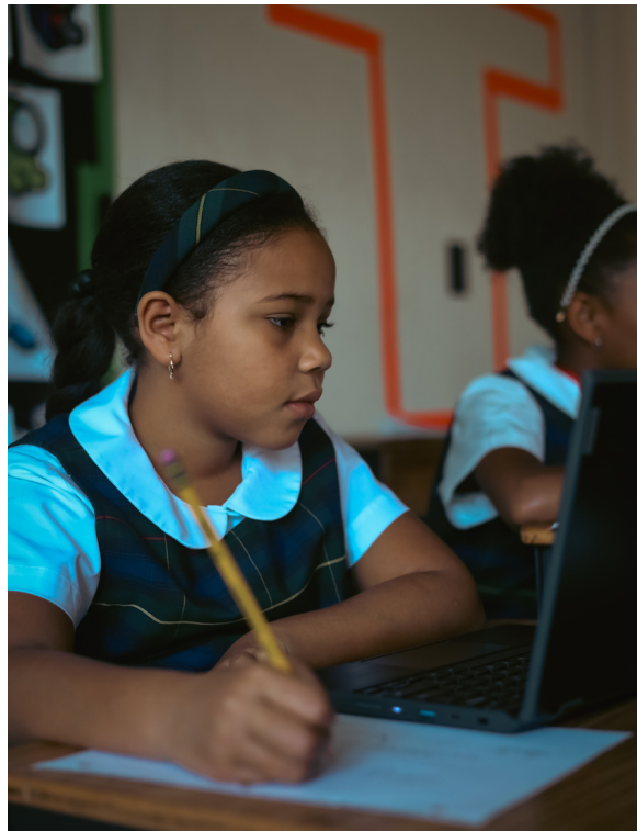
A 4th grade student intently focuses during MAP testing.