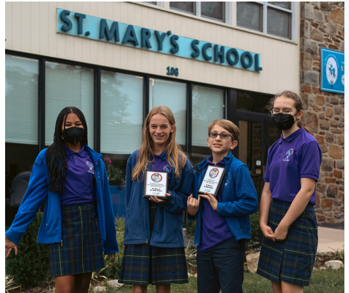
Members of the 2022 Rube Goldberg Team pose outside of SMS.

This past week our Rube Goldberg Team officially received their plaques for their international finished in the 2022 Rube Goldberg Competition. We look forward to another great season for this group as the prepre for the next challenge.