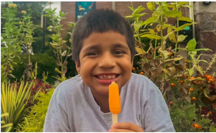
A 2nd grade student shows his joy for a cold treat on a hot day.