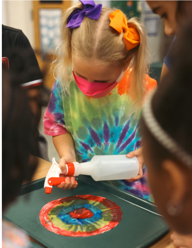
A kindergarten student conducts their capstone activity for their Color Unit.